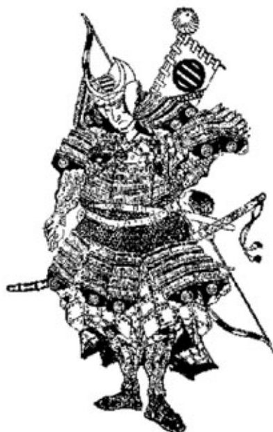
KUKISHINDEN RYU YOROIKUMIUCHI AND HANBOJUTSU DVD

For more information see Intro History to the Schools of the Bujinkan..